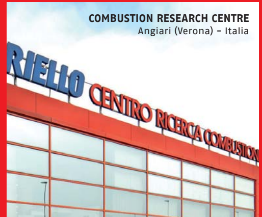
COMBUSTION RESEARCH CENTRE Angiari (Verona) - Italia

Across the world, Riello sets the standard in reliable, high-efficiency, low-maintenance burner technology. With burner capacities from 17 thousand to more than 122 million Btu/hr, Riello oil, gas, dual-fuel and Low NOx burners deliver unbeatable performance across the full range of residential and commercial heating applications, as well as in industrial processes.