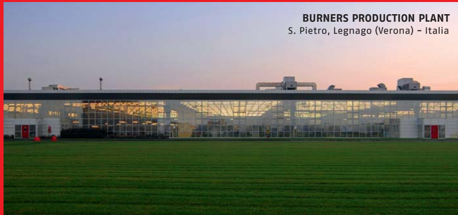
BURNERS PRODUCTION PLANT S. Pietro, Legnago (Verona) - Italia